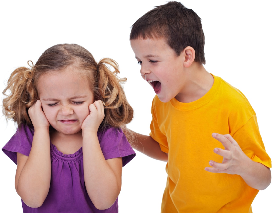
Quarreling kids - boy shouting at little girl, isolated

The universe is constantly clamoring to change your mind about something – whether it's in the form of Twitter feuds, political debates or Mountain Dew's horrible "puppy monkey baby" Super Bowl ad. But how many of these appeals to alter our views really succeed?